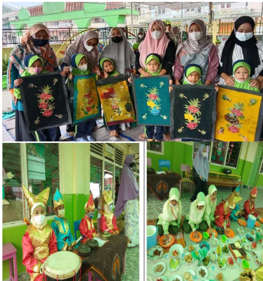
Figure 2. Activities to play traditional tambua, talempong, bajamba eat, and tanah liek batic

Harum baunnya sibungo rampai Jadi pamenan sianak daro Sabalum makan jo minum kakito mulai Mari kito badoa basamo-samo