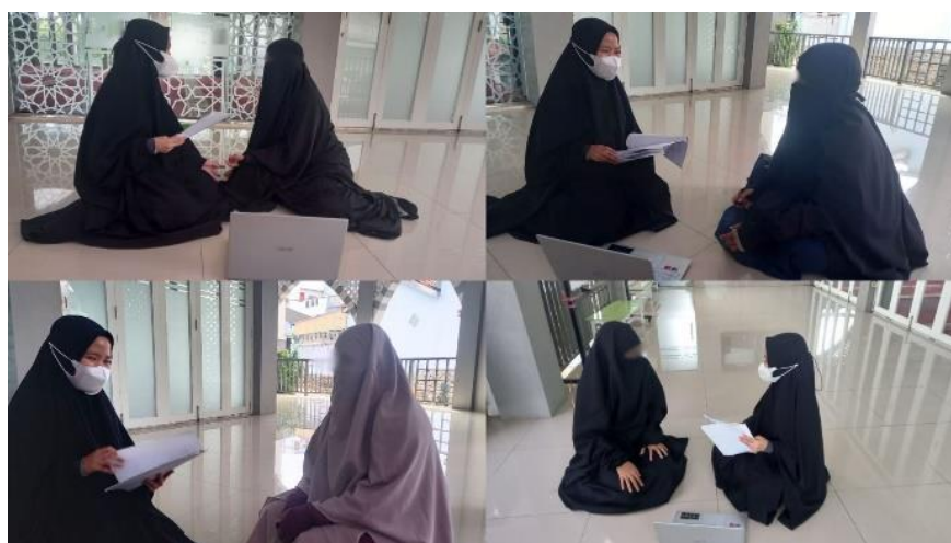
Figure 2. Interview with The Participants Section Two

The data collection techniques and instrument aids used in this study are interview guidelines (Table 2), observation guidelines and documentation guidelines. The procedure in this research was carried out in several stages, such as planning, implementation and reporting