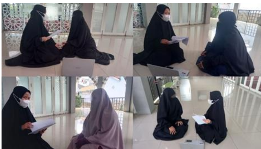
Figure 1. Interview with The Participants Section One